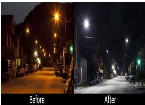
Figure 4 – Today vs Future

Lifi is in its developmental stage , and can still achieve greater levels and speeds clubbed with availability and more reliability along with enhanced security measures . Development in the Near field communication can be made through this.Also we may turn our street lights into potential modern age cellular towers, enhancing network opportunities.