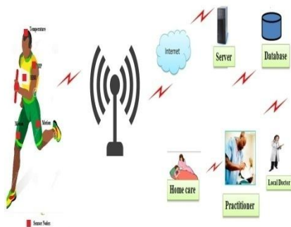
Example Scenario for Wireless Sensor Networks

health diagnosis. So using this technology for monitoring the patients and get fitness of our body.